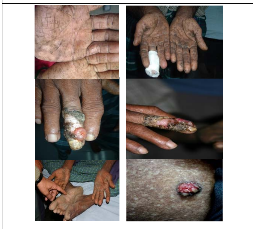
Box 1: Arsenic patients with visible symptoms of arsenicosis

A most recent study 2 conducted in six arsenic-affected villages in Bangladesh have shown that 10.2 percent of the population are affected by visible signs of arsenicosis (i.e., keratosis, melanosis, and karato-melanosis) with 16.1 percent among the poor, 5.4 percent among the non-poor, and 1.7 percent among the rich. The real rate of arsenicosis would be much higher than the rate with visible symptoms (shown in box 1), because many affected persons are yet to display visible symptoms and many others will have multiple organ complications with suppressed visible symptoms.